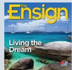
Ensign - Fall 2015